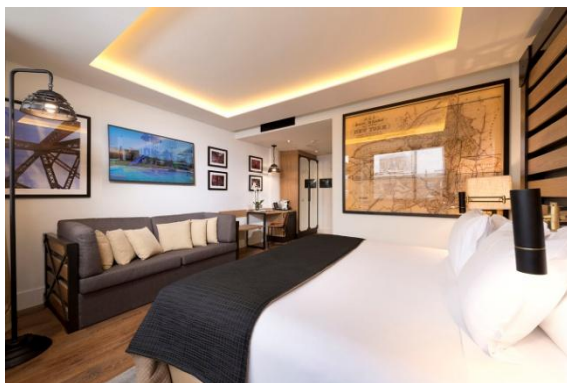
SUPERIOR DELUXE ROOM

Deluxe Rooms: bright and spacious 30 m 2 rooms that come with a Queen Size bed (1.80 x 2 m) or 1 x 2 m twin beds. Possibility of adding an extra 1 x 2 m bed.