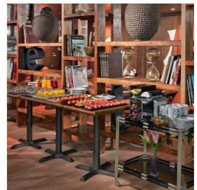
COFFEE BREAK IN THE LOBBY