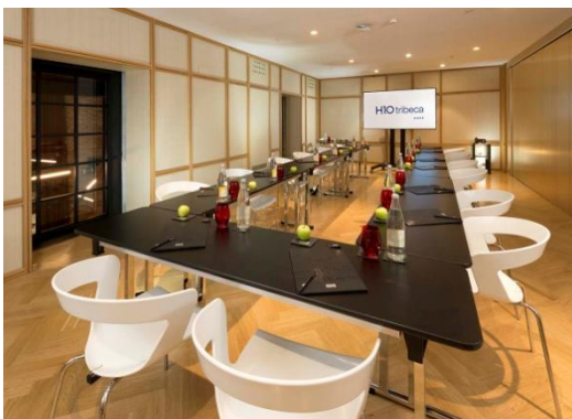
AZCA ROOM – U-SHAPE LAYOUT

* Maximum capacity (optimal) recommended for these rooms by event type.