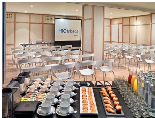
AZCA & TEIXEIRA ROOM – THEATRE LAYOUT