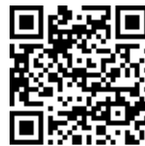
Hotel website app