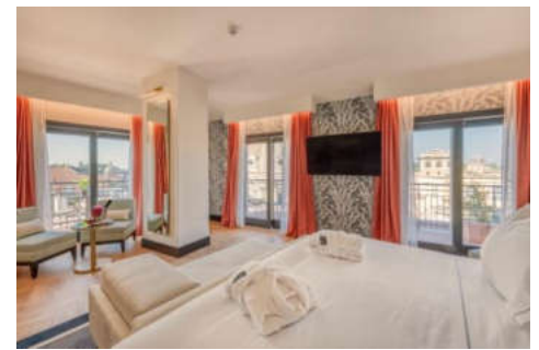
PANORAMIC VENEZIA TERRACE ROOM

Classic Rome Rooms: Comfortable rooms measuring 20 m 2 with an elegant design that combines classic elements with a more contemporary touch. Large windows overlooking the city.