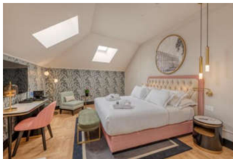
SUPERIOR ATTIC ROOM