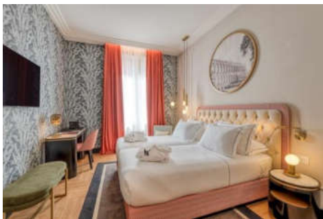
SUPERIOR ROME ROOM

Bathroom with hairdryer and magnifying mirror