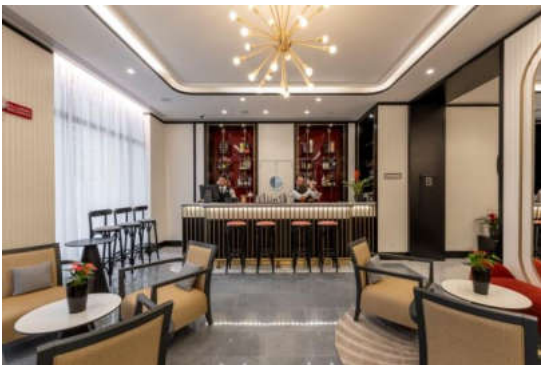
MASSIMO LOBBY BAR

Lucio Restaurant: the hotel's main restaurant offers a unique and elegant atmosphere.