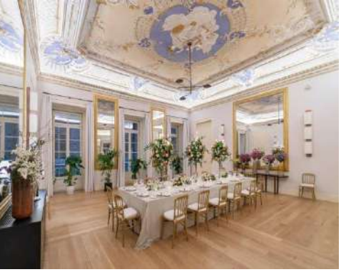
OS ESPELHOS – BOARDROOM LAYOUT