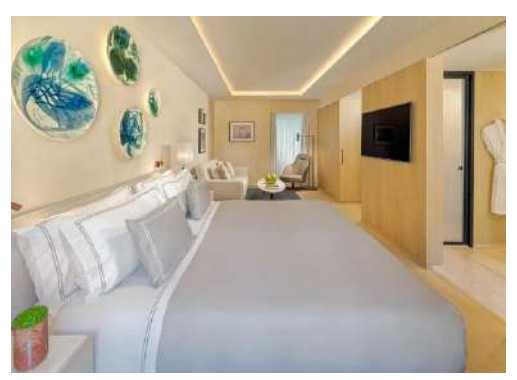
DELUXE FAMILY SECRET

Deluxe Family Secret: spacious rooms with an average size of 35 m<sup>2</sup>. They have a sofa bed and are the best option for families looking for additional space.