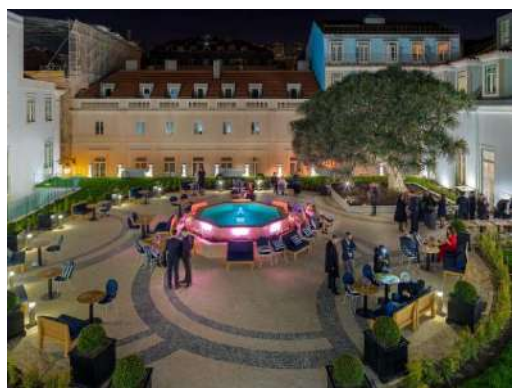
CELEBRATION IN THE GARDENS