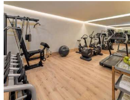
EXPERIENCE POOL TREATMENT ROOM GYM