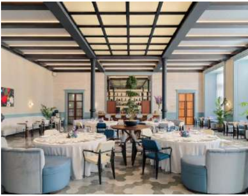
BOEMIO LOUNGE – BANQUET LAYOUT