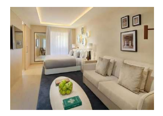
views from the Deluxe Family Rooms are of the palace's inner courtyards.

Deluxe Family: spacious rooms with an average size of 35 m<sup>2</sup>. They have a sofa bed and are the best option for families looking for additional space. The