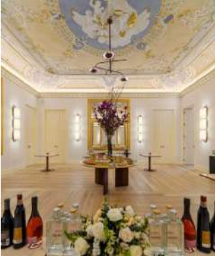
OS ESPELHOS – COCKTAIL