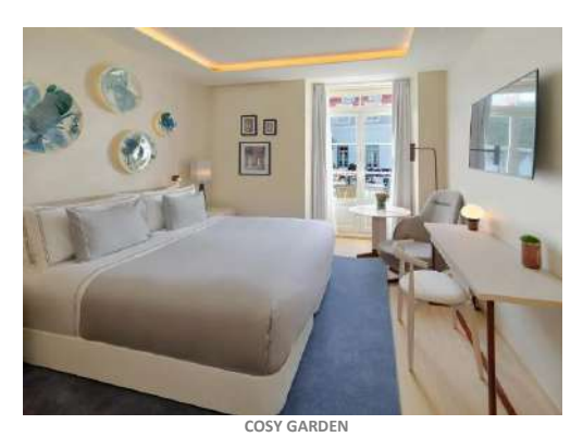
They can accommodate up to 2 people.