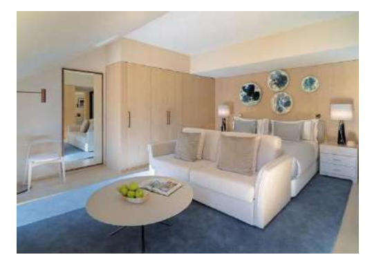
GRAND STUDIO SUITE

The Suite offers views to Rua das Portas de Santo Antão and can accommodate up to 2 adults plus two children (or a third adult).