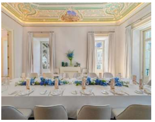
O DRAGOEIRO – BOARDROOM LAYOUT

The hotel's four magnificent event rooms, with large windows and coffered ceilings with handpainted frescoes, are ideal for receptions and banquets in an atmosphere of luxury and distinction and the extensive gardens are an exceptional setting for unforgettable celebrations.