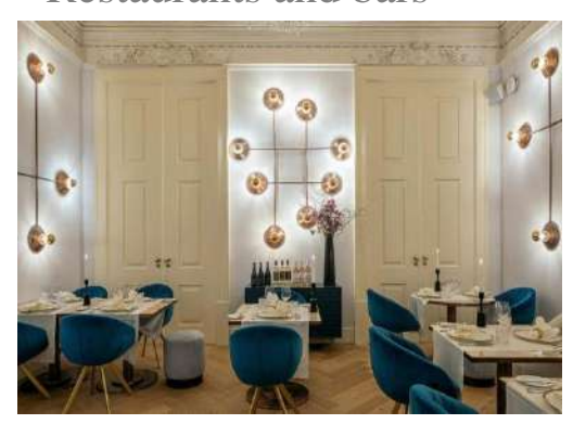
CONDES DE ERICEIRA

Condes de Ericeira: located in one of the grand halls of the palace and with direct access to the gardens, the Condes de Ericeira Restaurant is a new gastronomic hotspot in Lisbon.