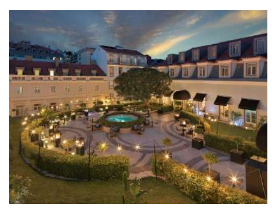
O JARDIM WINE BA