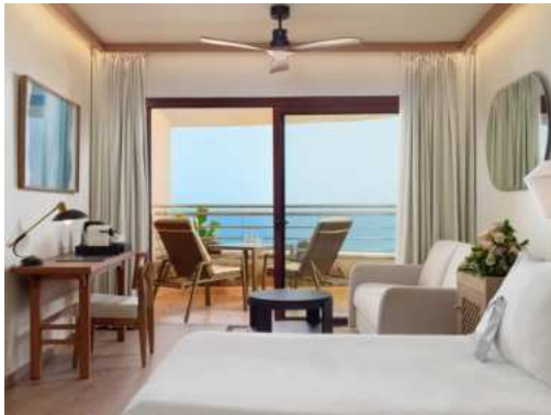
PRIVILEGE ROOM – SEA VIEW

Privilege Rooms: 40.50 m 2 rooms with a balcony of 8.7 to 12 m 2 overlooking the sea or the swimming pool. They have two single beds of 1.05 x 2 m and a sofa bed of 0.90 x 1.80 m. In addition to the services offered in the other rooms, these rooms also offer the following: