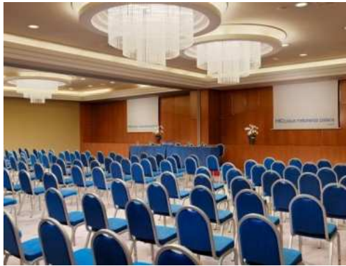
GRAN CANARIA & BANDAMA ROOM - THEATRE LAYOUT