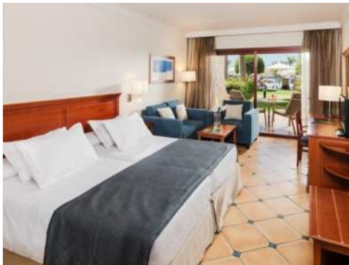
GARDEN VIEW – DOUBLE ROOM

Fully equipped bathroom with hairdryer, magnifying mirror and scales