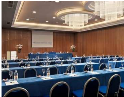
BANDAMA ROOM - CLASSROOM LAYOUT