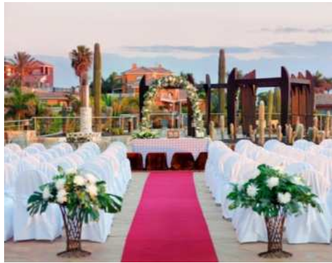
CELEBRATION ON THE TIRAJANA TERRACE