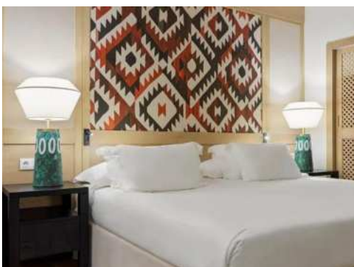
DELUXE SUPERIOR ROOM SEA VIEW

They can accommodate up to 3 adults or 2 adults + 1 child.