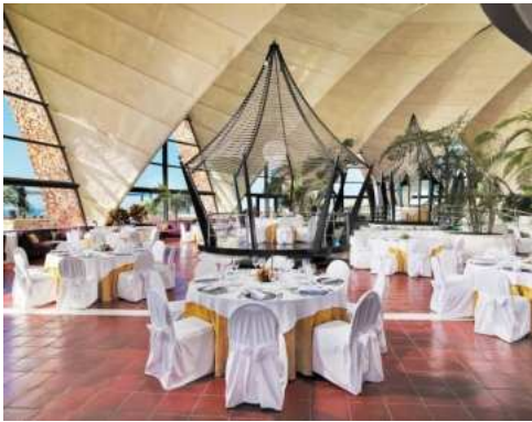
BANQUET IN THE TIRAJANA GRAND HALL

At the H10 Playa Meloneras Palace , we take care of every detail so your celebration turns out just how you dreamt it would. The hotel is located in a unique environment and offers exclusive spaces for celebrations with spectacular sea views.