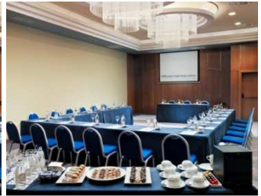
MELONERAS ROOM - "U-SHAPE" LAYOUT