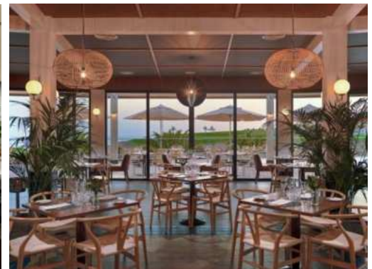
NATURALIA & LA BRASSERIE