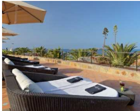
PRIVILEGE TERRACE WITH SEA VIEWS