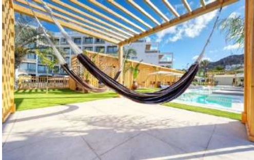
SUN LOUNGER AREA