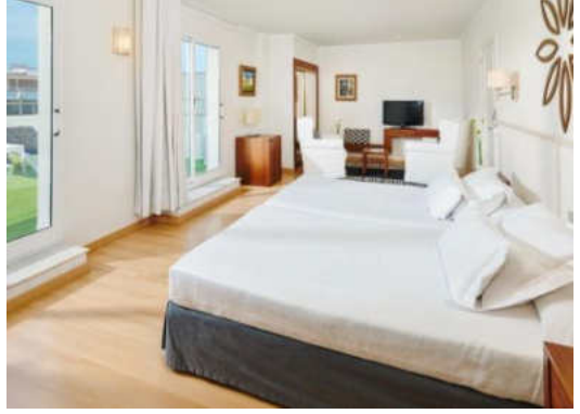
SUPERIOR DOUBLE ROOM

Double Rooms: comfortable and functional 16 m<sup>2</sup> rooms with a double bed or two twin beds. They can accommodate up to 3 people (with an extra bed). Some rooms have pool views ($).