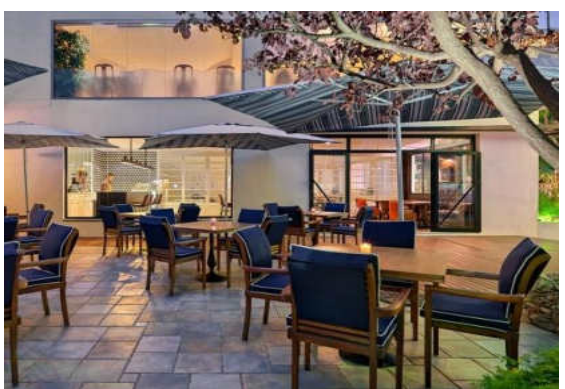
ROOFTOP BAR BLUE VIEW

Mike's Coffee: specialising in tea, coffee and home-made pastries. It also has a pleasant terrace.