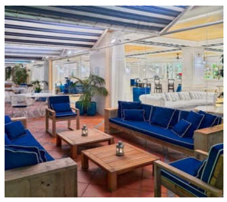
DRY BLUE BAR TERRACE