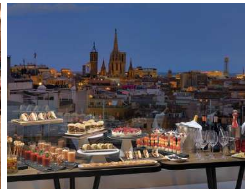
DRINKS RECEPTION ON ATIK TERRACE