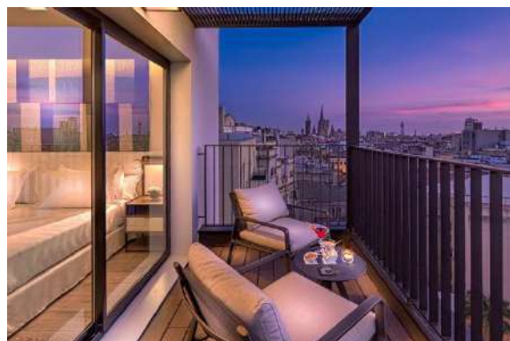
JUNIOR SUITE WITH TERRACE

They can accommodate up to 2 adults + 2 children or 3 adults.