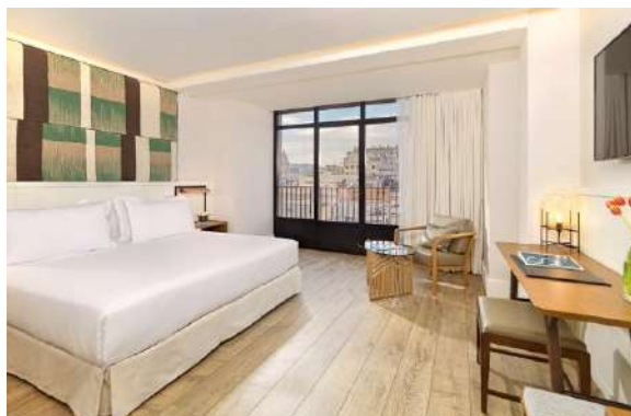
SUPERIOR BARCELONA ROOM

Superior Barcelona Rooms: spacious 28 m 2 rooms with large windows overlooking Via Laietana or Ciutat Vella. They come with a King Size bed (2 x 2 m) or twin beds (1 x 2 m) and some with a sofa bed (in some rooms measuring 0.90 x 1.90 m and in others 1.35 x 1.90 m). They can accommodate up to 2 adults + 2 children or 3 adults.