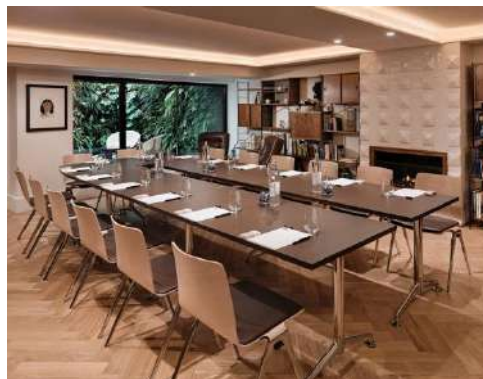
THE LIBRARY – U-SHAPE LAYOUT