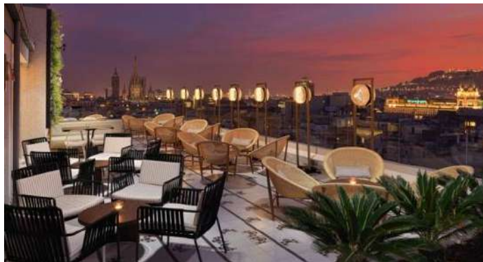
ATIK TERRACE & ROOFTOP BAR

Robotik Bar: located in the lobby, is a space used for group events.