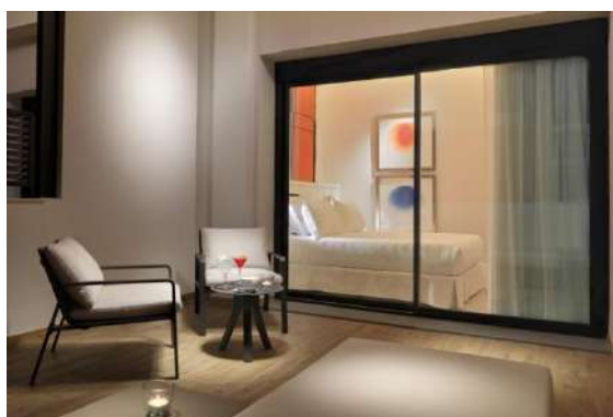
CLASSIC ROOM WITH TERRACE

Classic Rooms with Terrace: 22 m 2 double rooms with large windows and a pleasant private furnished terrace overlooking Via Laietana or Ciutat Vella. They come with a double bed (in some rooms measuring 1.80 x 2 m and in others 2 x 2 m) or twin beds (1 x 2 m), as well as a 0.90 x 1.90 m sofa bed. Maximum capacity of 3 adults.