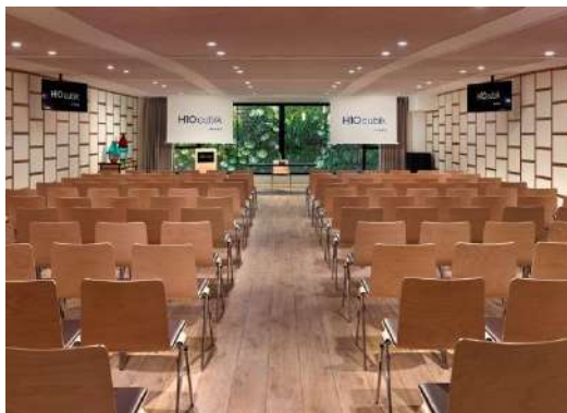
UNIK ROOM – THEATRE LAYOUT