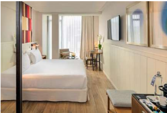
CLASSIC BARCELONA ROOM

Classic Rooms: comfortable 21 m 2 rooms overlooking the hotel's interior patio. They come with a double bed (in some rooms measuring 1.80 x 2 m and in others 2 x 2 m) or twin beds (1 x 2 m) and can accommodate up to 2 adults.