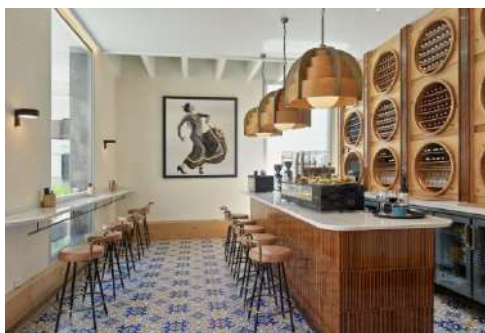
BAR LA MUNDIAL

Lobby Bar: located in the hotel lobby, it offers a pleasant atmosphere in which to have a coffee or enjoy cocktails and snacks.