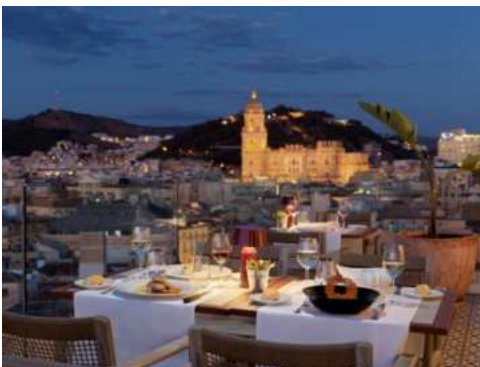
RESTAURANT ROOFTOP BAR

The bar can be accessed from the street.