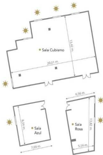
Área y Capacidad · Area and Capacity

*Provisional information on the capacity of these meeting rooms by event type.