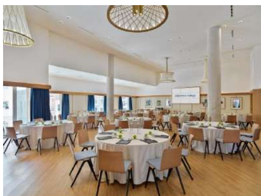
CUBISMO ROOM – CABARET LAYOUT