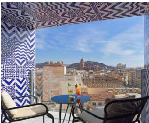
CATHEDRAL SUPERIOR DOUBLE ROOMS

Rooms with a maximum capacity of 2 adults.