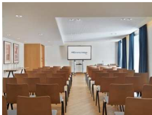
ROSA ROOM – CLASSROOM LAYOUT