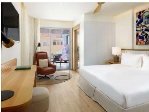
SUPERIOR DOUBLE ROOM

Superior Double Rooms: rooms from 25 m 2 overlooking the centre of Málaga. Each with an original design, private, furnished terrace.