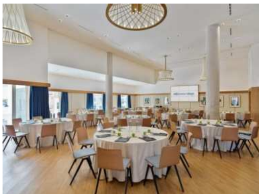
CUBISMO ROOM – CABARET LAYOUT