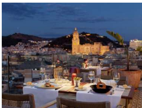
RESTAURANT ROOFTOP BAR

The bar can be accessed from the street.