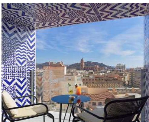
CATHEDRAL SUPERIOR DOUBLE ROOMS

Rooms with a maximum capacity of 2 adults.