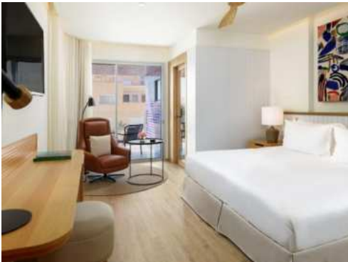
SUPERIOR DOUBLE ROOM

Superior Double Rooms: rooms from 25 m 2 overlooking the centre of Málaga. Each with an original design, private, furnished terrace.