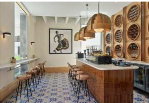
BAR LA MUNDIAL

Lobby Bar: located in the hotel lobby, it offers a pleasant atmosphere in which to have a coffee or enjoy cocktails and snacks.