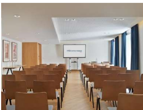
ROSA ROOM – CLASSROOM LAYOUT